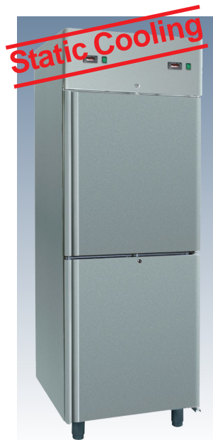
LSSI 7030KEEN (optional with feet)

Measuring range -100/+1000 °C. Length 2 m. Other ranges on request.