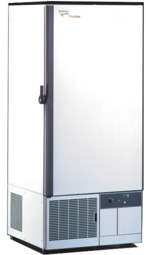
ProfiLine PLECU 51405