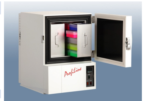
ProfiLine Pegasus PLPE 0486 (With accessories Inventory Systems. See sep. brochure.)