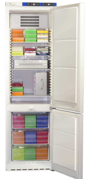
ProfiFrost PFU40xxKWU (Fig. with inventory system. See catalogue.)