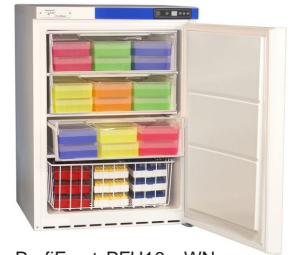
ProfiFrost PFU16xxWN (Fig. with optional cryoboxes. See catalogue.)