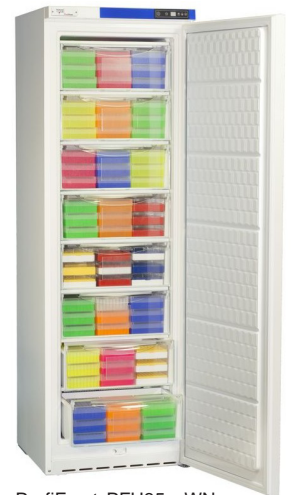
ProfiFrost PFU35xxWN (Fig. with optional cryoboxes. See catalogue.)