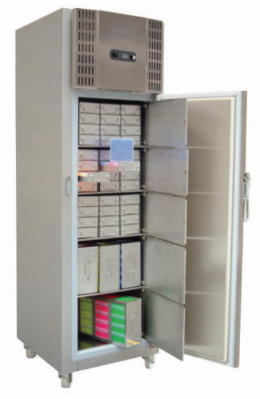
ProfiLine Pegasus PLPE 45..